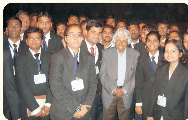
Final year students with Honorable Dr. A.P.J. Abdul Kalam